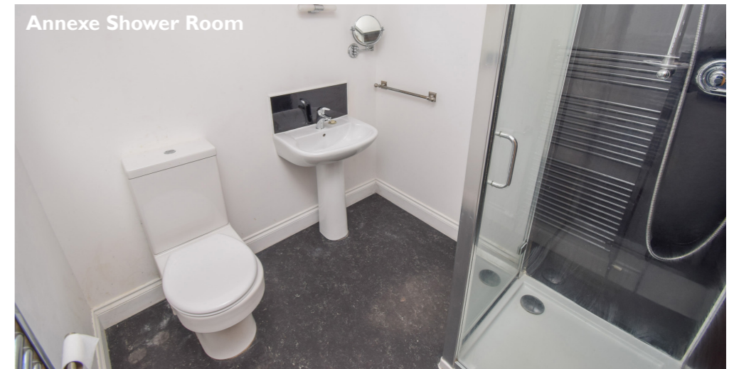
Annexe Shower Room